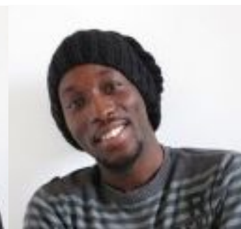
Murani - Volunteer ICT Support