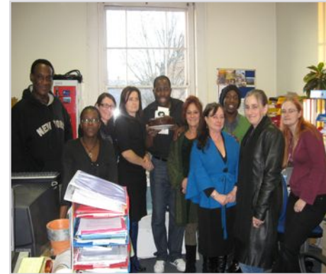
Some of the VCH Team

Your support and service have positioned VCH for greatness as the Volunteer Centre for Hackney and enabled us to provided an effective and efficient service to our customers.